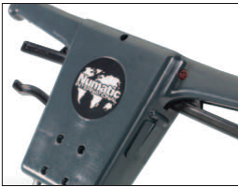
Simple to Use Operator Handle

Also available in 115V/120V specification.