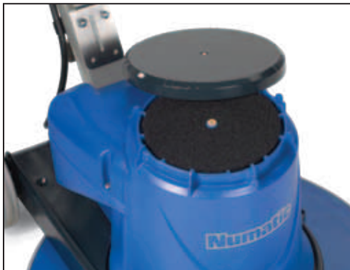
Optional Hi-Dust Filter